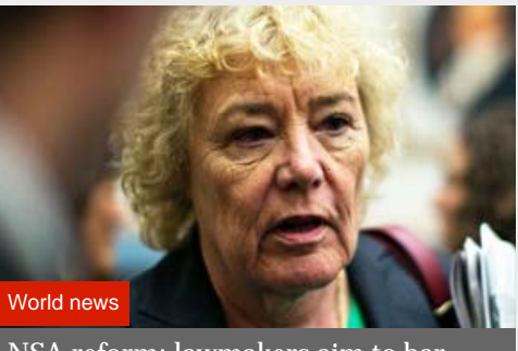
NSA reform: lawmakers aim to bar agency from weakening encryption