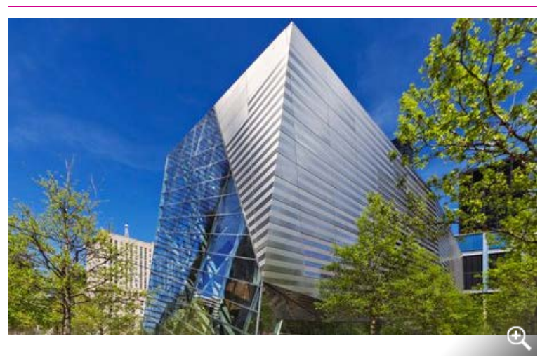
Rising up like an apparition... Snøhetta's 9/11 Memorial Museum on the World Trade Center site.

The Guardian, Tuesday 13 May 2014 Jump to comments (352)