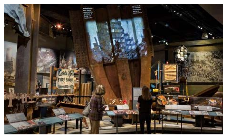
Inside the museum, items on display are taken from the 10,000-strong collection of objects salvaged from the site: a crushed fire engine and a charred firefighter's axe, salvaged uniforms, flags and toys.

It is a form of fetishised architectural salvage that makes more sense when it is cleverly stitched into the visitors' route — where, for example, a set of eroded concrete stairs, down which many of the survivors fled to safety, is placed alongside the staircase down which you must walk. At the bedrock level there are also some powerfully understated moves, such as exposing the column foundations that march in a mute line around the perimeter where the towers once stood, marking the threshold between the cavernous, looser lobby area and the sanctified space of the exhibition within.